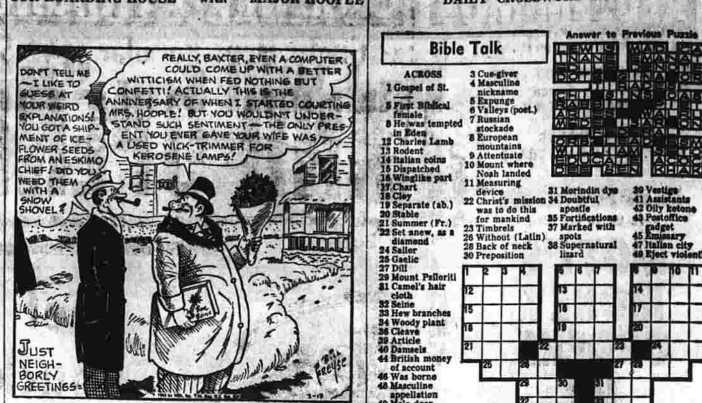
OUR BOARDING HOUSE with MAJOR HOOPLE