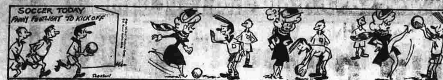
SOCCER TODAY (From "Football to Kickoff")