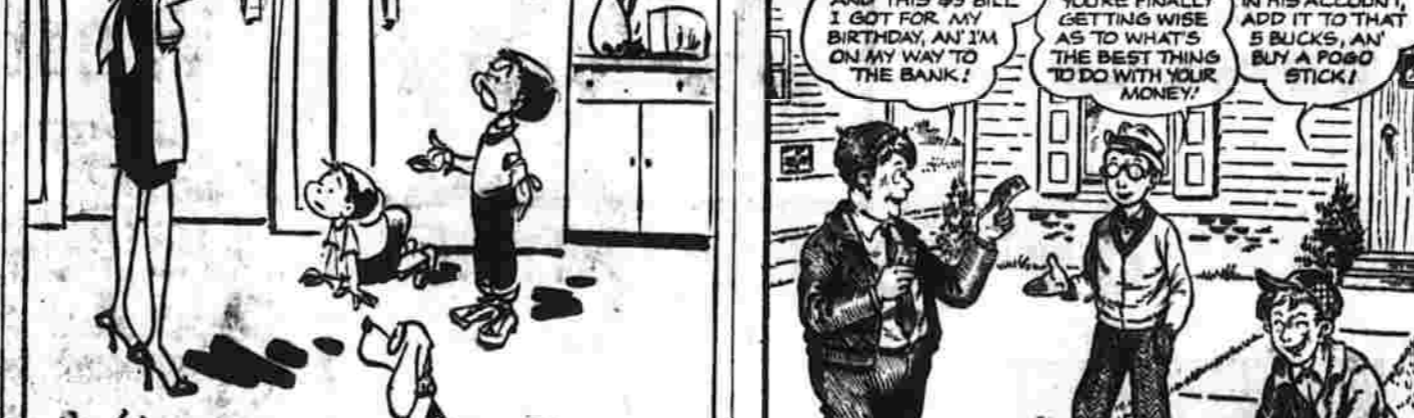
OUT OUR WAY